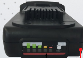
Battery with charging status indication