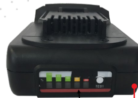
Battery with charging status indication